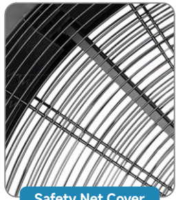
Safety Net Cover